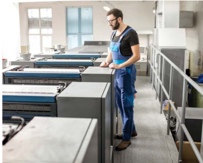
Rolling out DELMIA Ortems solutions in record time has led to more fluid production flows.