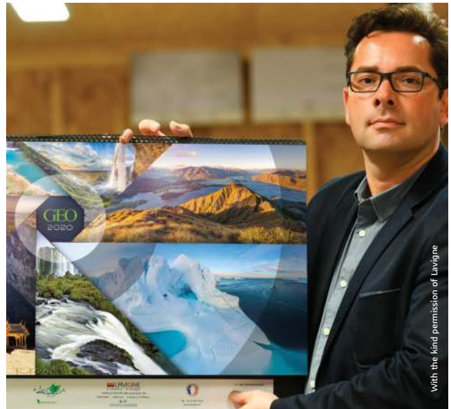
With the kind permission of Lavigne